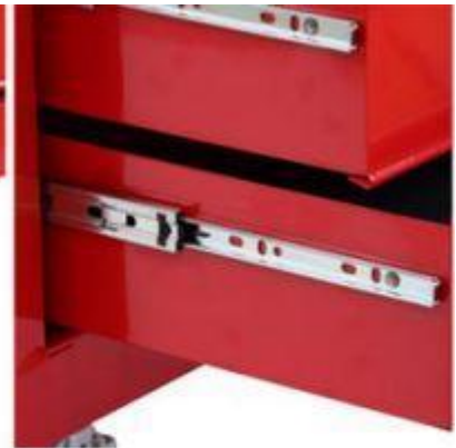
Sliding Rail Each Drawer has sliding rails.