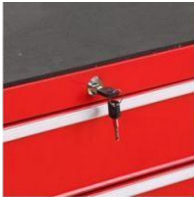
Key Key to Lock