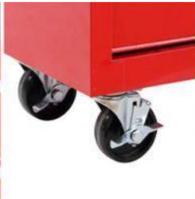
Lockable Casters Four lockable casters help move the cabinet more easily.